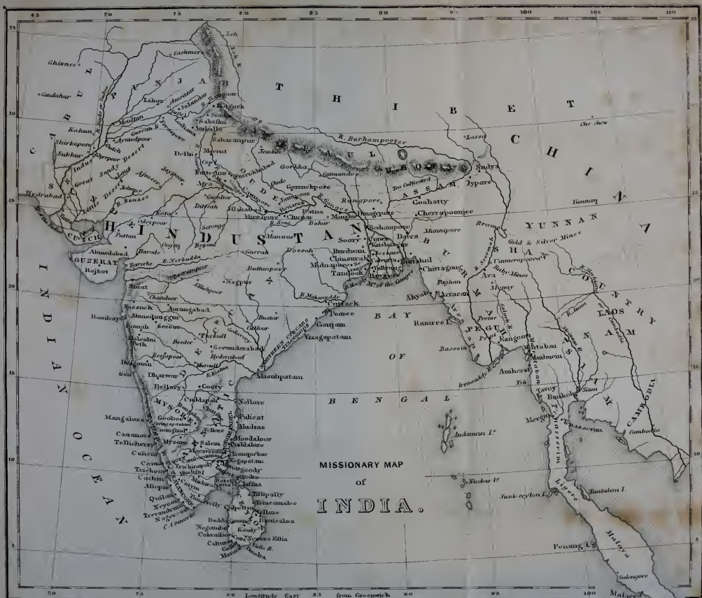
for "Two Years in Upper India."